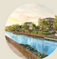
Therapeutic Canal Corridor