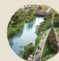
Cycling & Jogging Track