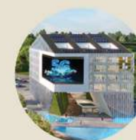
Business Accelerator Centre